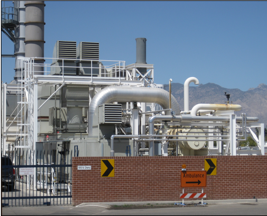
Left: the cogeneration plant serving north campus and the Arizona Health Sciences Center. This unit generates 5 MW of electric power and 28,000 lb/hr of steam for use in the Health Sciences Center and adjacent Hospital.