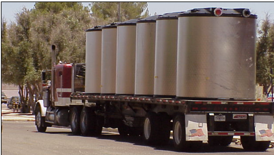
In 2006, the University installed its first Thermal Energy Storage (TES) system. It includes three 1,200 Ton Glycol chillers, plate and frame heat exchangers, and over 100 Calmac Ice Tanks. The intent of the system is to shift operation of electric driven chillers from periods of peak campus cooling and high utility electric demand to less expensive off-peak, night-time hours. The system has operated with no control-related lost time. Following the success of the first plant, the University installed a second TES plant in 2008 at the Central Heating and Refrigeration Plant (CHRP) on main campus. The second system includes a 1,200 Ton Glycol chiller and approximately 50 individual tube-in-tank storage units.